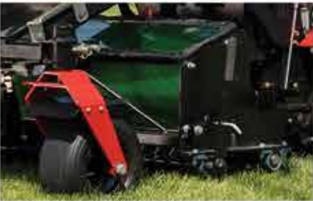
36-INCH SLICE SEEDER