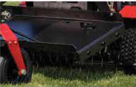
46-INCH DETHATCH RAKE

Also Available: 40-inch Spike Style Aeration Head