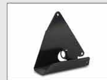
HOSE TRAY — 15 FT.