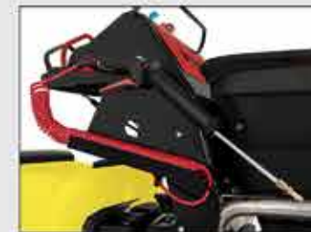
30-FT. EXTENDED HOSE LENGTH WITH HOSE TRAY