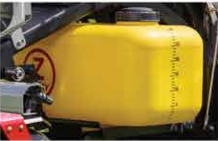
30 GALLON SPRAY SYSTEM