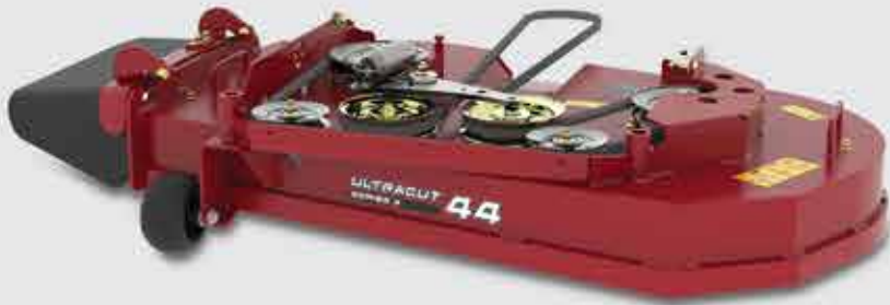
UltraCut Series 3

Accessories may not fit each mower model. Please visit exmark.com or check with your local dealer on accessory fit-up for each model.