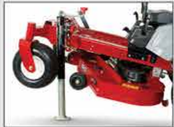
JACK AND MOUNT RECEIVER