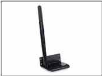
BAR AND STEP ASSIST