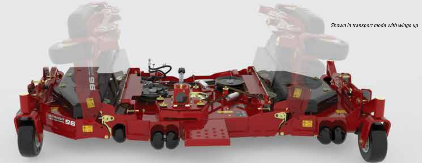
Shown in transport mode with wings up

Our UltraCut mowing systems are the ultimate in a floating deck for efficiency, quality of cut and rugged durability. Regardless of which one you choose, your mower will deliver the cut quality, durability and longevity you expect from Exmark.