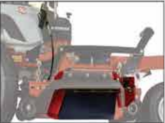
OPERATOR CONTROLLED DISCHARGE