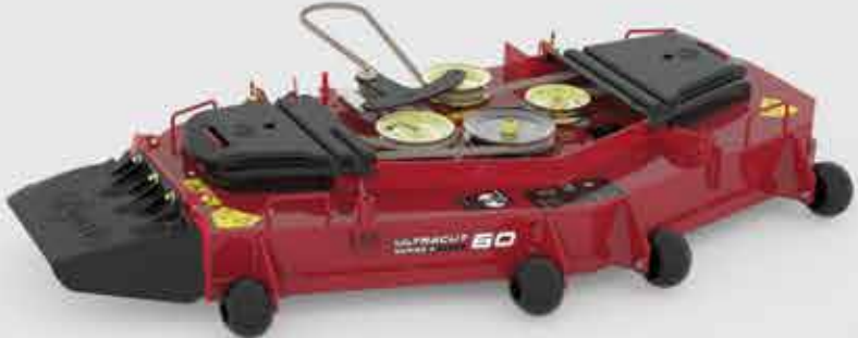
UltraCut Series 4 deck is shown

At the heart of every Turf Tracer are Exmark's full-floating UltraCut decks. Series 3 decks are on the S-Series, and deeper, more heavy-duty Series 4 decks are on the X-Series. Both decks feature robust, yet flexible, discharge chutes, designed to reduce the possibility of impact damage from trees, rocks and other obstacles. These full-floating decks precisely follow ground contours to deliver a more consistent height of cut and reduced scalping.