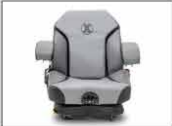
AIR RIDE SUSPENSION SEAT