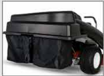
2-BAG COLLECTION SYSTEM