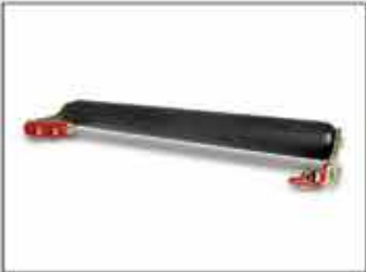
TURF STRIPING KIT

Also Available: Anti-Scalp Roller Kit, Equipment Cover, Operator Controlled Discharge and Walk-Behind Weight Set