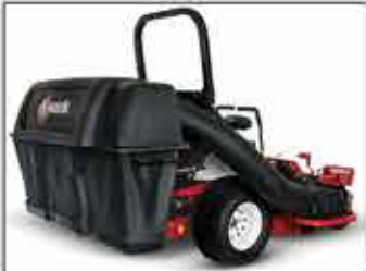
ULTRAVAC COLLECTION SYSTEMS

Also Available: 3-Bushel Bagger, 12-Volt Power Adapter, Equipment Cover, Extended Drive Lever, Finish Cut Baffles, Floor Mat, Harness Add-On Accessory, Hitch Kit, Hydro Maintenance Kit, Jack, Jack Mount Receiver, Power Deck Lift, Rear Anti-Scalp, Seat Isolation System, Side Wear Bar, Trash Container and White Non-Marking Side Bumper