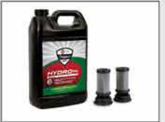
HYDRO MAINTENANCE KIT