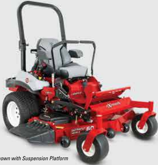
Shown with Suspension Platform