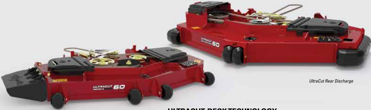
UltraCut Series 6