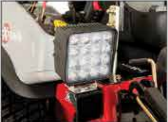
LED LIGHT KIT