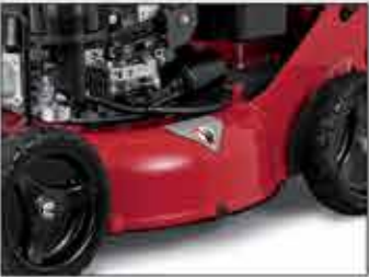
DECK WEAR KIT