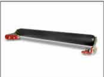
TURF STRIPING KIT