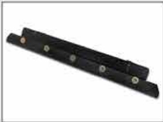
TURF STRIPING KIT

Also Available: Armrest Kit, Bag Mount Kit, Floor Mat, Hitch Kit, Hour Meter, Trash Container and Weight Kit