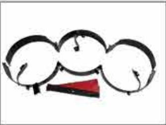
FINISH CUT BAFFLES