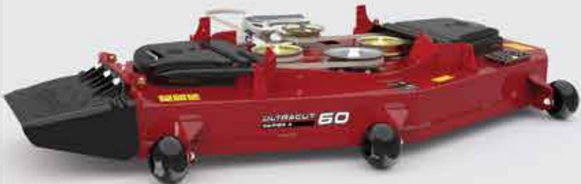
UltraCut Series 4 deck is shown

Exmark’s exclusive UltraCut decks are featured on Radius models in a choice of 44-, 48-, 52- and 60-inch cutting widths. Every UltraCut cutting deck features Exmark’s exclusive maintenance-free, sealed-bearing spindle assemblies. These spindles provide thousands of hours of trouble-free service and are truly the premium standard for reliability, durability and reduced downtime. All components in these decks work together to deliver the quality of cut you expect from an Exmark mower.