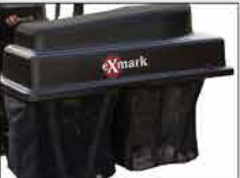
ULTRAVAC™ COLLECTION SYSTEMS

Also Available: 3-Bushel Bagger, 12-Volt Power Port, 5-Gallon Bucket, Bucket Mount Kit, Anti-Scalp Roller Kit, Engine Maintenance Kits, Finish Cut Baffles, Front Bucket Mount, Front Bucket Mount & 5-Gallon Bucket, Full Suspension Seat & Tilt Frame, Hydro Maintenance Kit, Jack, Standard Seat Cover, Suspension Seat Cover, Tilt Frame & ISO Mounts and White Non-Marking Side Bumper