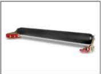
TURF STRIPING KIT