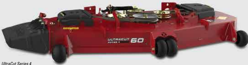
UltraCut Series 4

Exmark's heritage with commercial landscapers puts durability at the forefront of our design process. The Staris features Exmark's industry leading UltraCut decks. The UltraCut Series 3 cutting decks are available on the E-Series, with a choice of a 32-, 36- or 44-inch deck. UltraCut Series 4 cutting decks are featured on the large-frame S-Series models with a choice of a 48-, 52- or 60-inch deck. Exmark optimized the frame design and caster wheel positioning for each cutting deck width to deliver a superior quality of cut. The side-discharge UltraCut cutting decks also offer the ability to mulch or bag clippings when equipped with the appropriate accessories from Exmark.