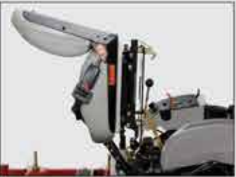
COMFORT RIDE SEAT SUSPENSION

Also Available: 2-Post Foldable ROPS, Automatic Door Opener Kit, Dual Semi-Pneumatic Rear Casters, Harness Add-On Accessory, Micro-Mulch System, Narrow Drive Tire, Rollover Protection System (ROPS), and Tire and Wheel Assembly.