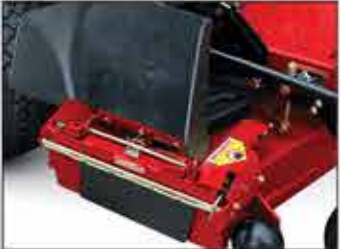
OPERATOR CONTROLLED DISCHARGE