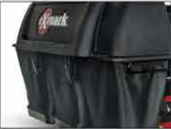
ULTRAVAC™ COLLECTION SYSTEMS

Also Available: Anti-Scalp Roller Kit, Hitch Kit, Jack, Jack Mount Receiver, Trash Container, Light Kit, Slow Moving Sign, Operator Control Discharge, Rear Guard, Turf Striping Kit and White Non- Marking Side Bumper