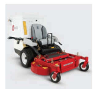
NAVIGATOR® • Dedicated Bagger