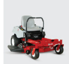
QUEST® E-Series S-Series

We set our bar high so that you can get the best value from a zero-turn mower that is high-performing, ergonomic and easy to maintain.