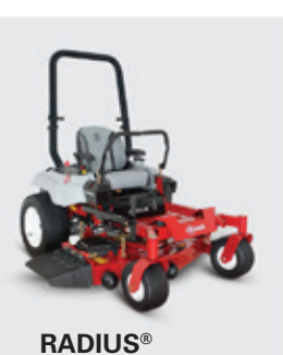
E-Series S-Series Suspension Platform