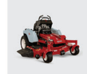
STARIS® E-Series S-Series