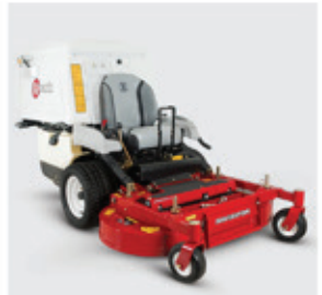
NAVIGATOR® • Dedicated Bagger